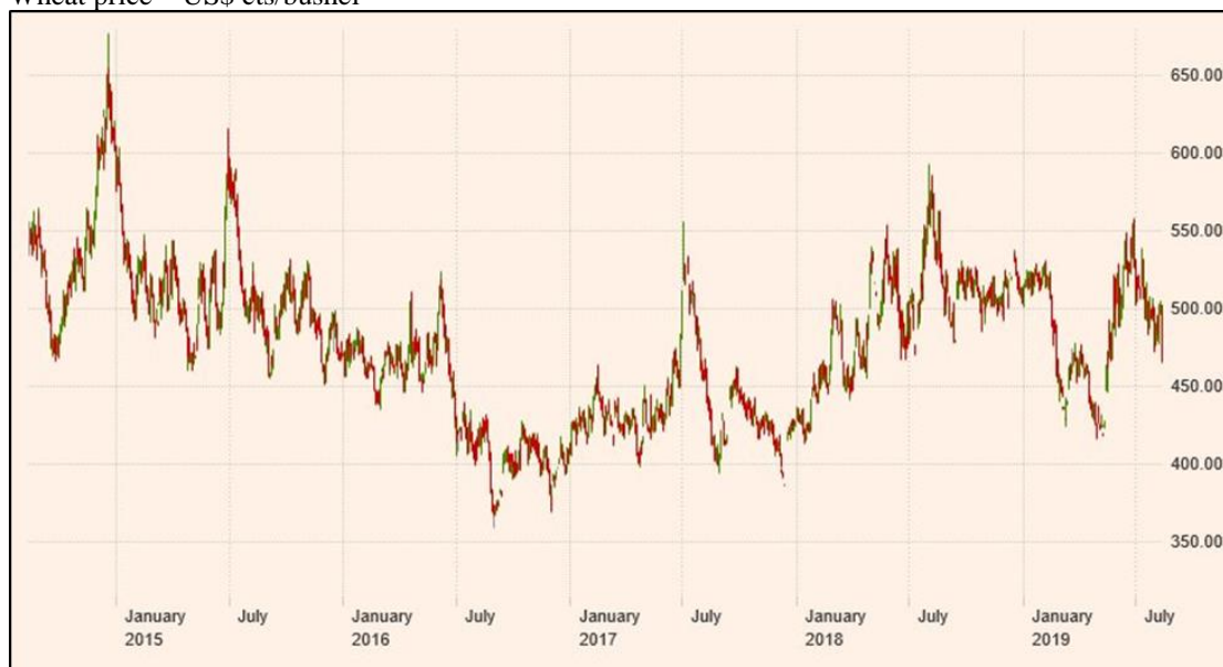
Wheat price – US$ cts/bushel